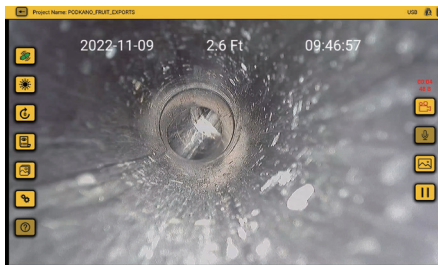
The VMC app controls all the reel functions

The reel is powered by internal Li-ion batteries, which provide consistent, clean, long-life power. A six-hour charge will provide 12 hours of power with intermittent sonde use.