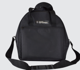
Reel Carry Bag