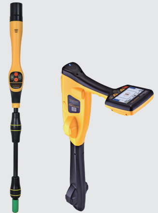
VM-540 and vLoc3-Cam Sonde Locator