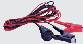
DC input lead