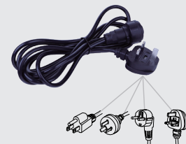
AC Mains Lead