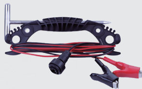
Direct connection lead and ground stake