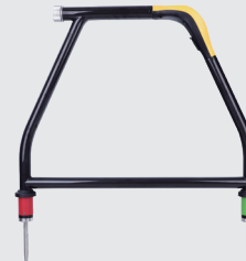
VM-510FFL+ Fault Locator