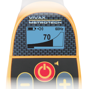
Peak locate response with accompanying audio tone

Powered by two AA alkaline batteries that typically provide 20 hours of use, the VM-540 is designed for reliable daily use.