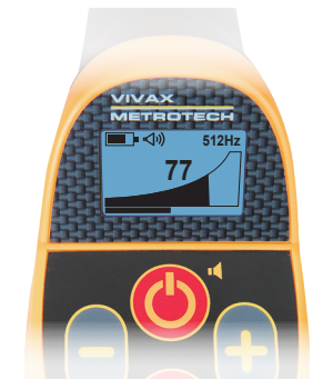
Multiple sonde frequencies